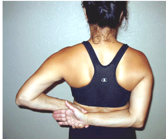
Figure 4: A custom-designed self-care stretching protocol

This action, in conjunction with pain-free soft-tissue balancing, releases the frozen shoulder, oftentimes in as little as one session. Although some people in the health-care industry are skeptical about the feasibility of releasing long-term frozen shoulders, orthopedic-massage practitioners have witnessed the release of frozen shoulders multiple times, in cases where the participants had previously been diagnosed with adhesive capsulitis by their physicians. The same approach has proven highly successful in releasing adhesive capsulitis of the hip, as part of a dynamic pelvic stabilization protocol for treating low back pain, SI joint pain, bulging discs and sciatica.